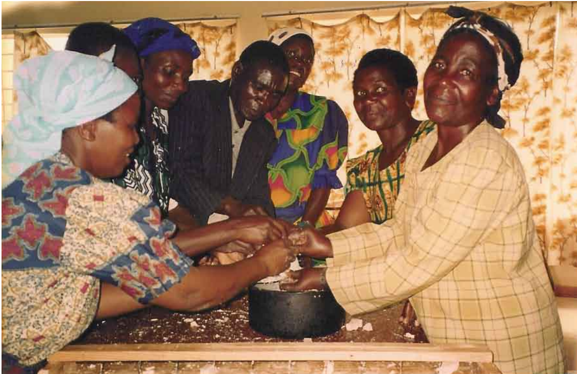
Soap Making Project